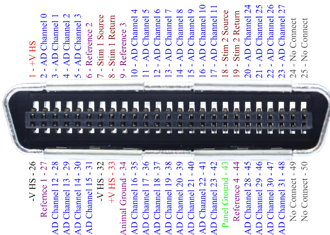
Male MDR-50 Connector

A 50 pin MDR connector made by 3M is used for the headstage tether connection. The Cooner cable consists of 28 conductors. The tether wires are soldered directly to the HS-18-CNR-MDR50 circuit board to eliminate the mass of an additional connector. Figure 2 shows the pinout of the MDR-50 connector.